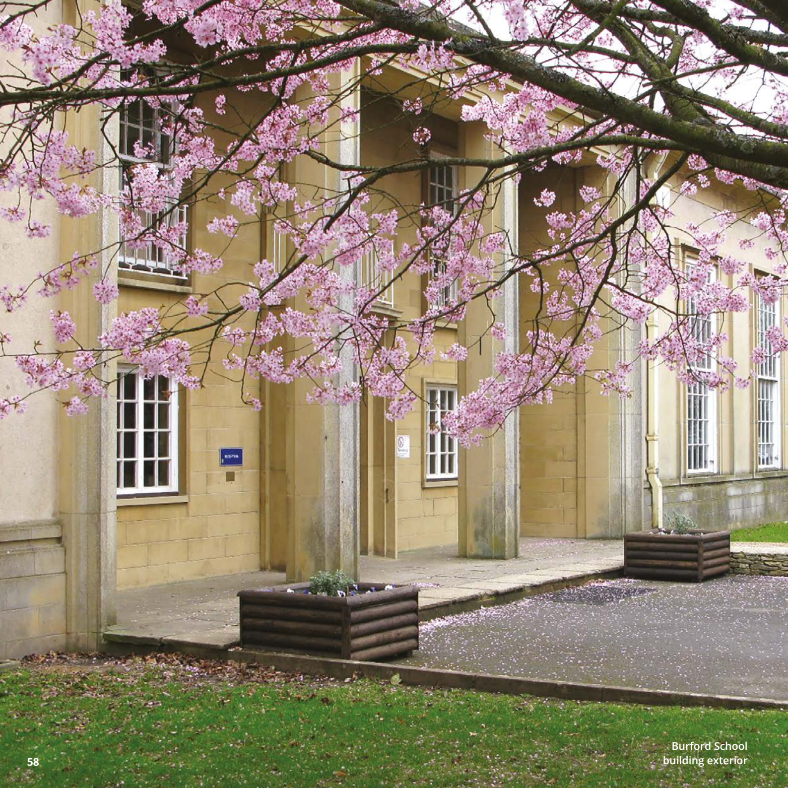
Burford School building exterior