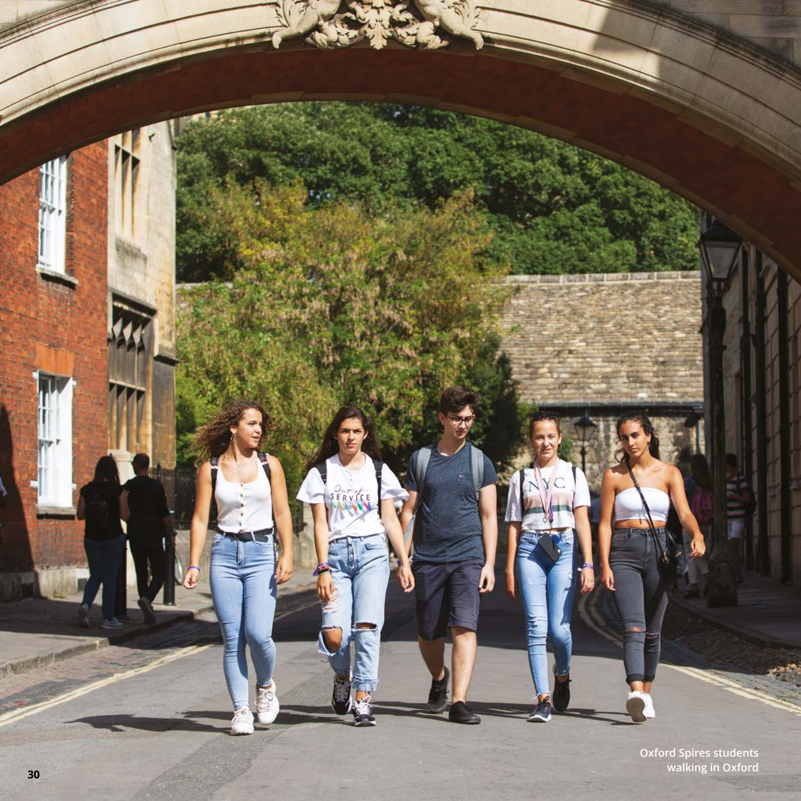
Oxford Spire students walking in Oxford