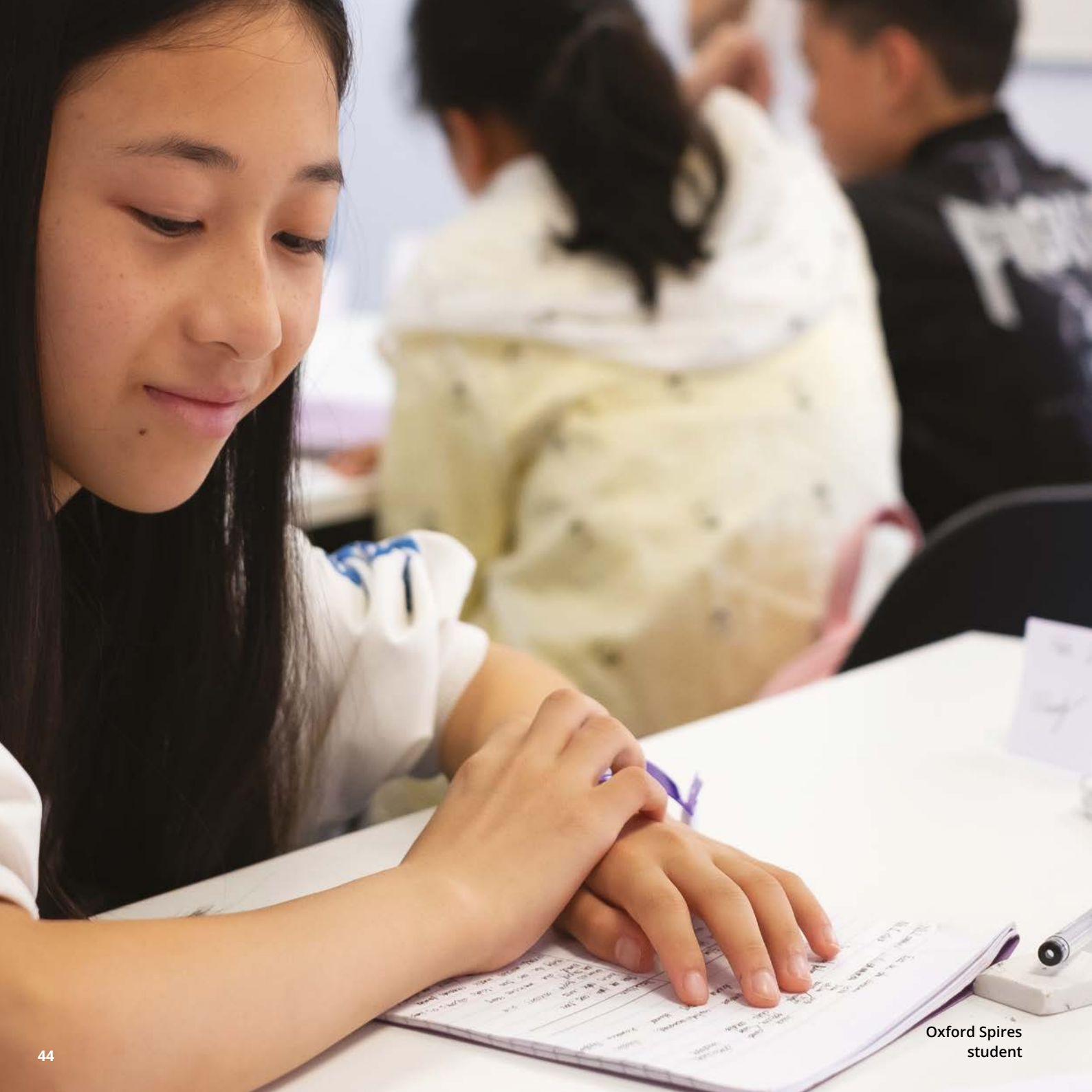
Oxford Spires student