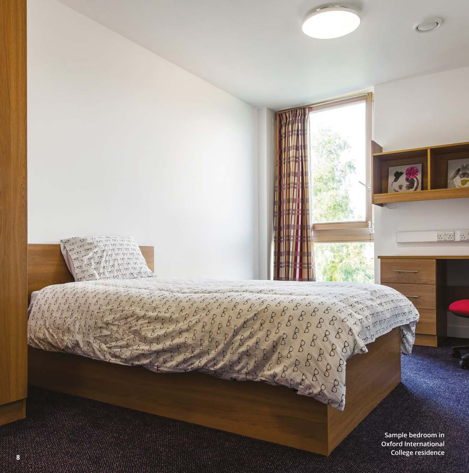
Sample bedroom in Oxford International College residence