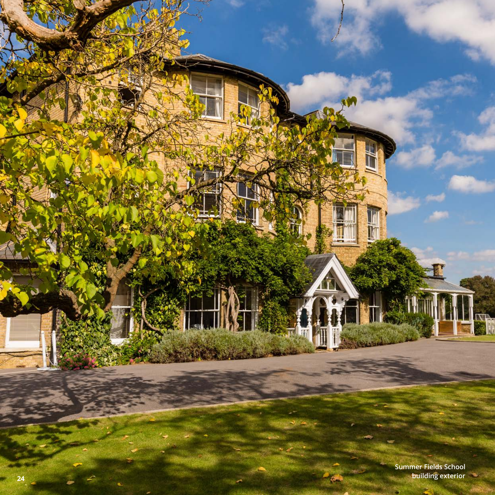
Summer Fields School building exterior