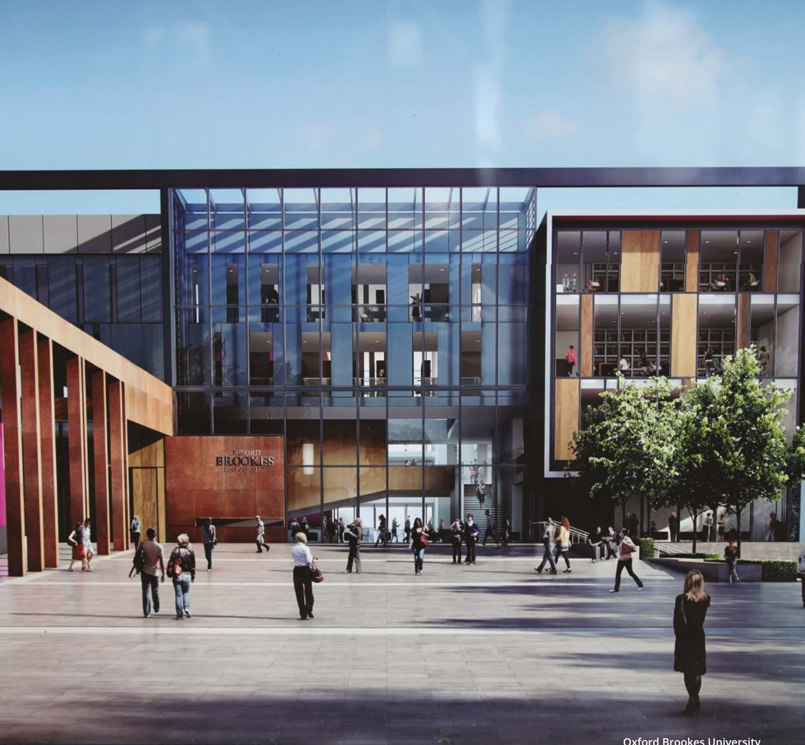
Oxford Brookes University - John Henry Brookes building, main campus