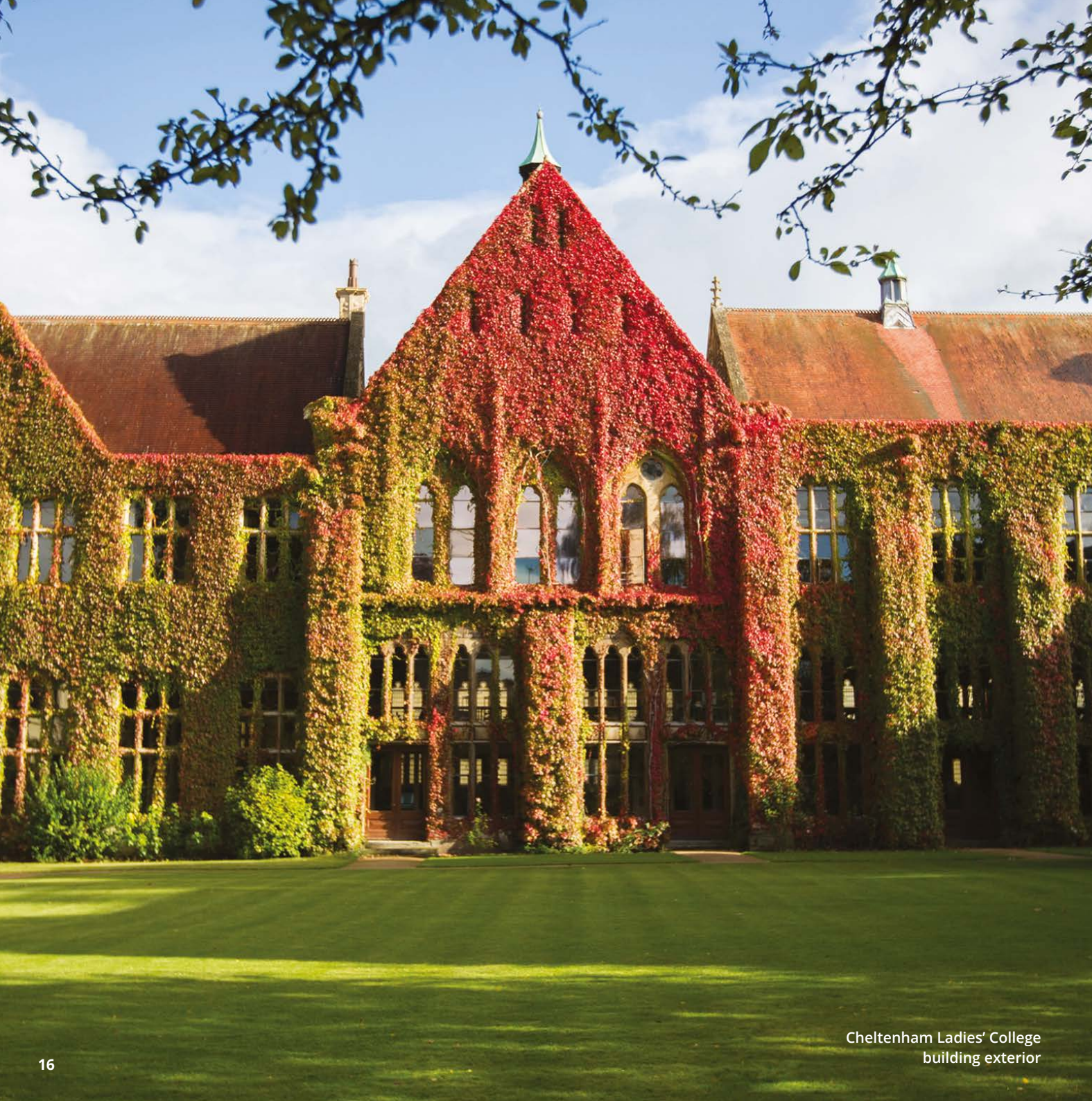
Cheltenham Ladies' College building exterior