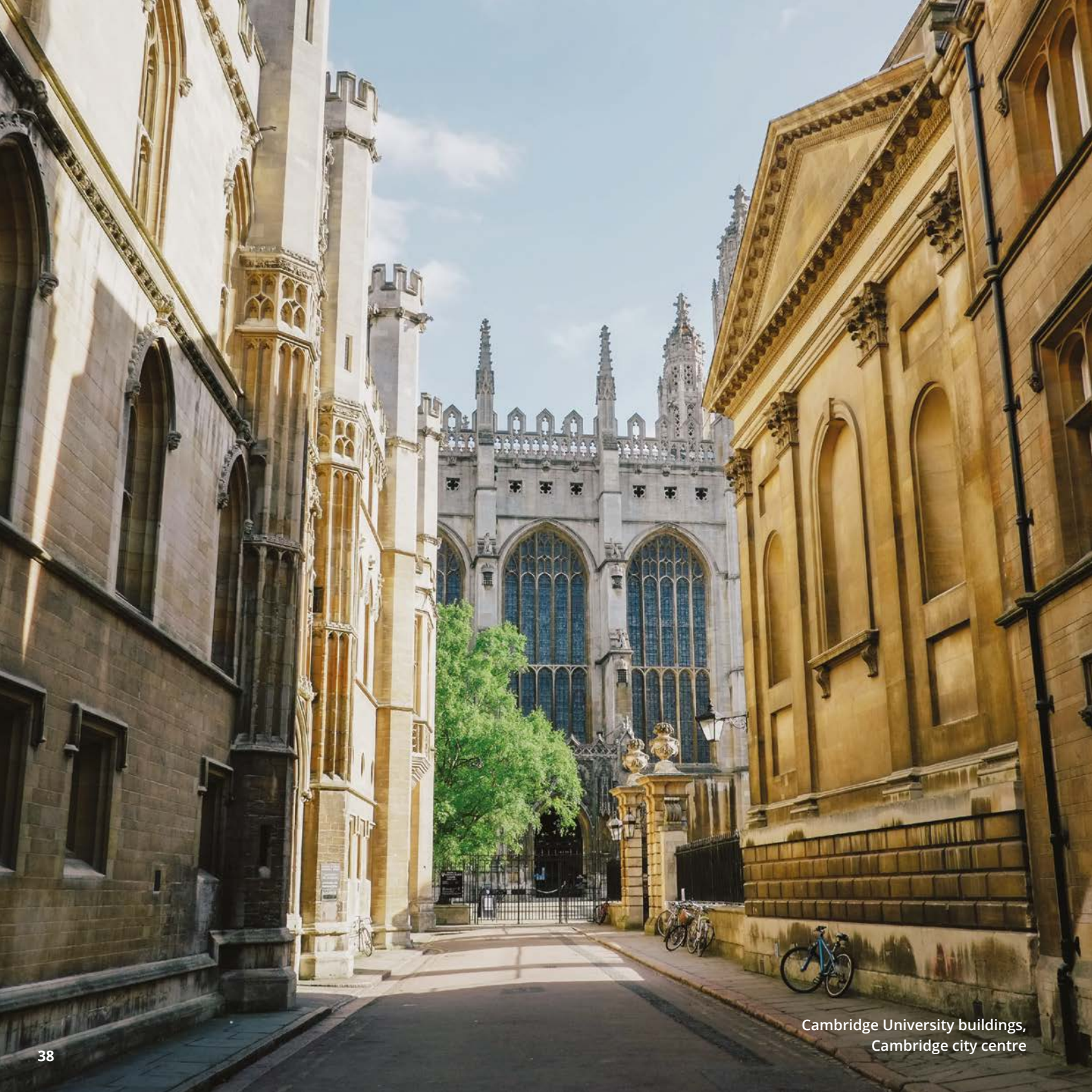
Cambridge University buildings, Cambridge city centre