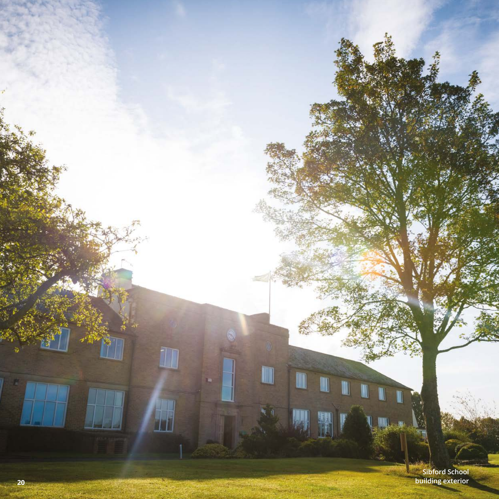
Sibford School building exterior