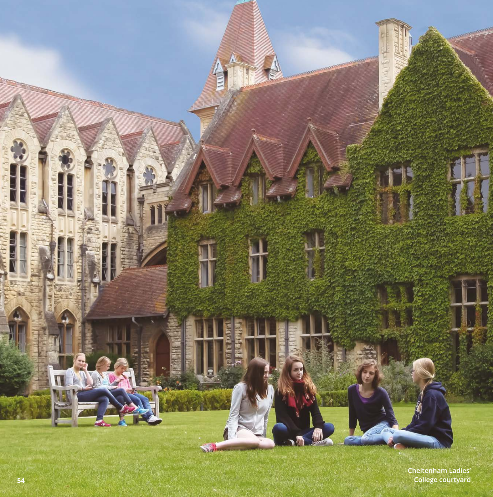
Cheltenham Ladies' College courtyard