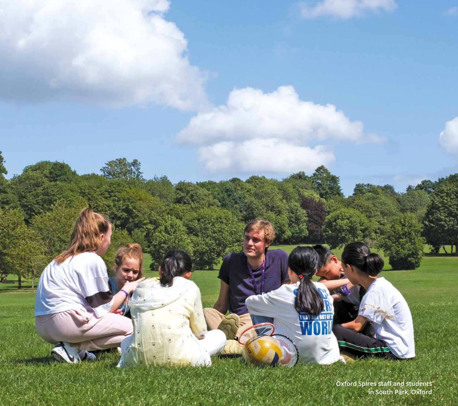
Oxford Spires staff and students in South Park, Oxford