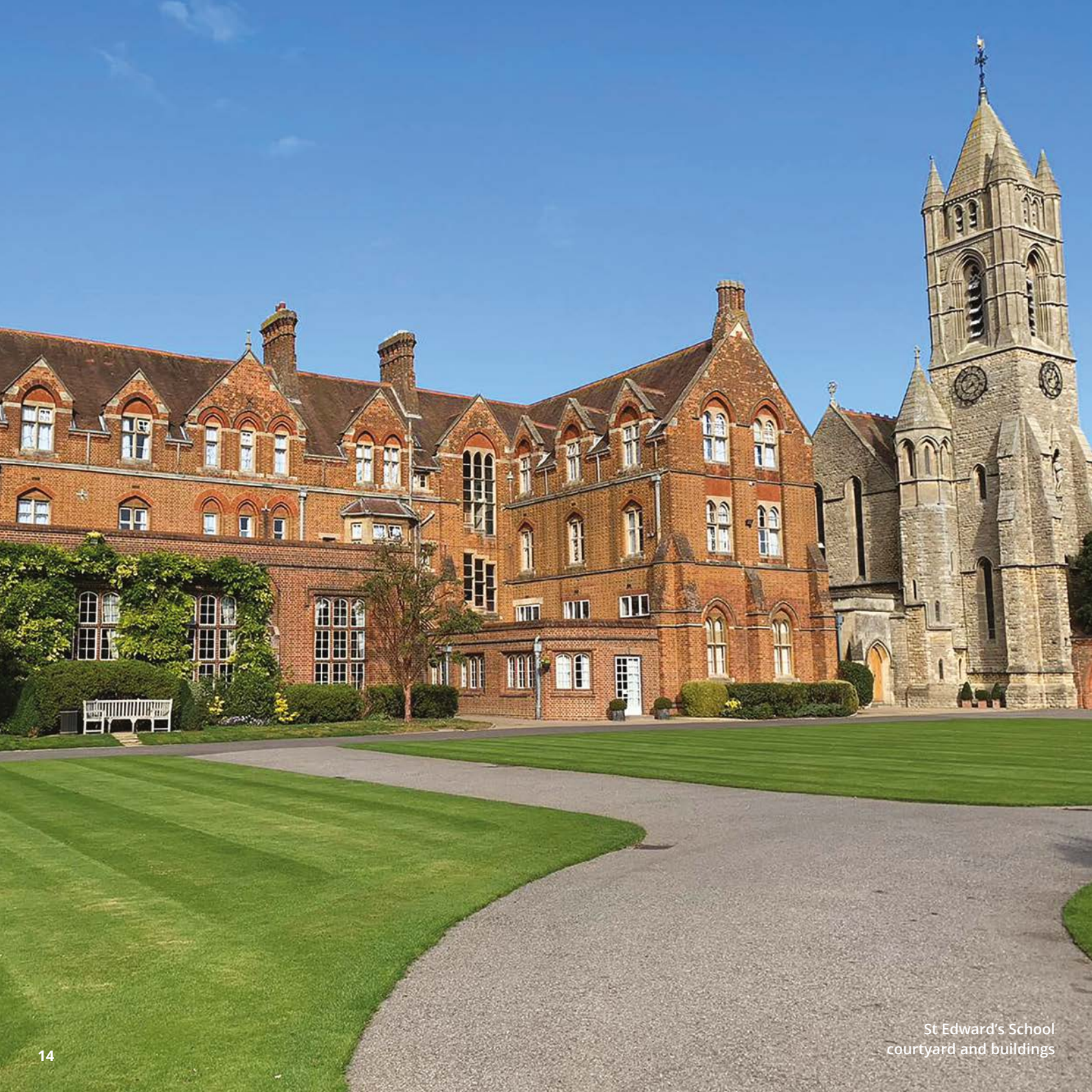
St Edward's School courtyard and buildings