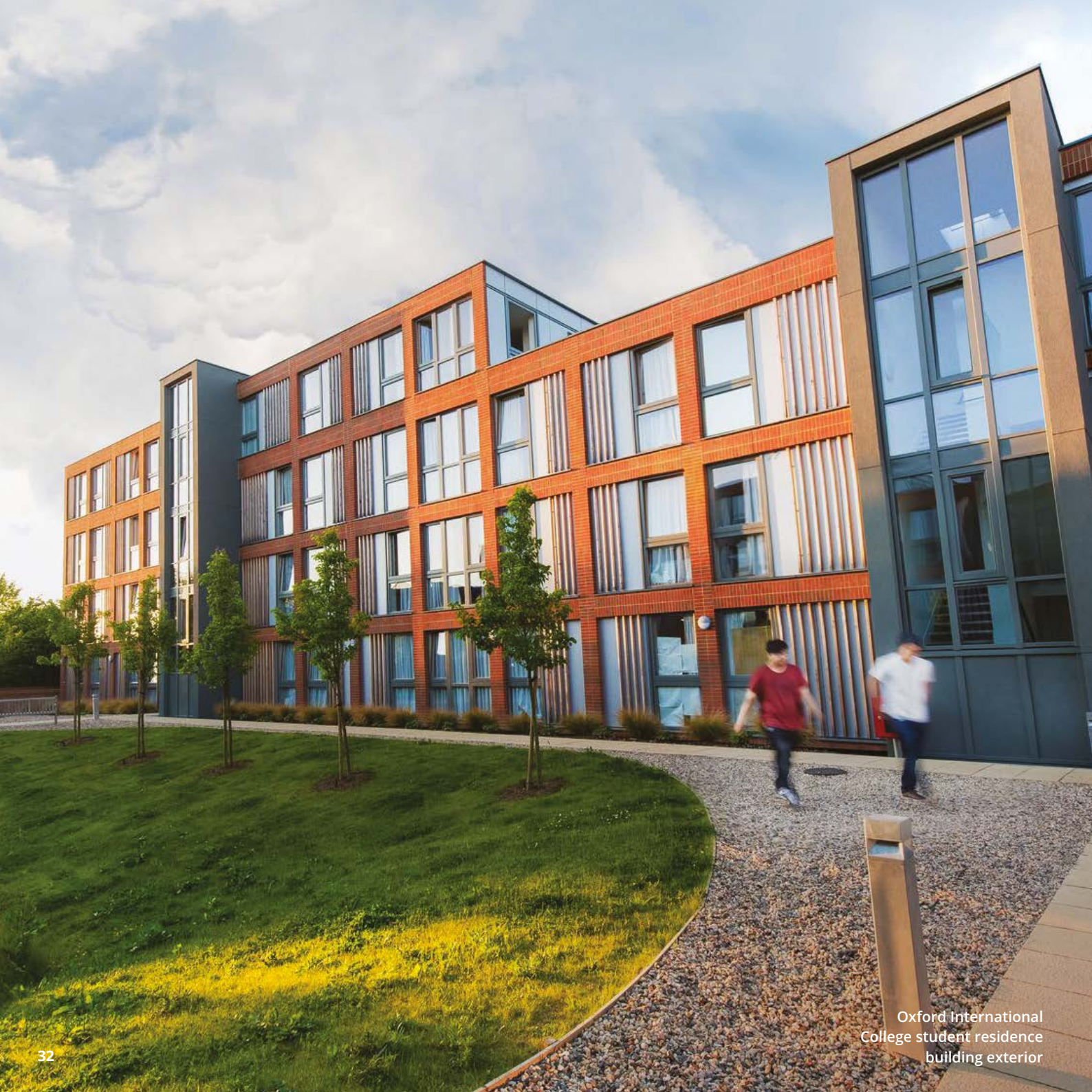
Oxford International College student residence building exterior