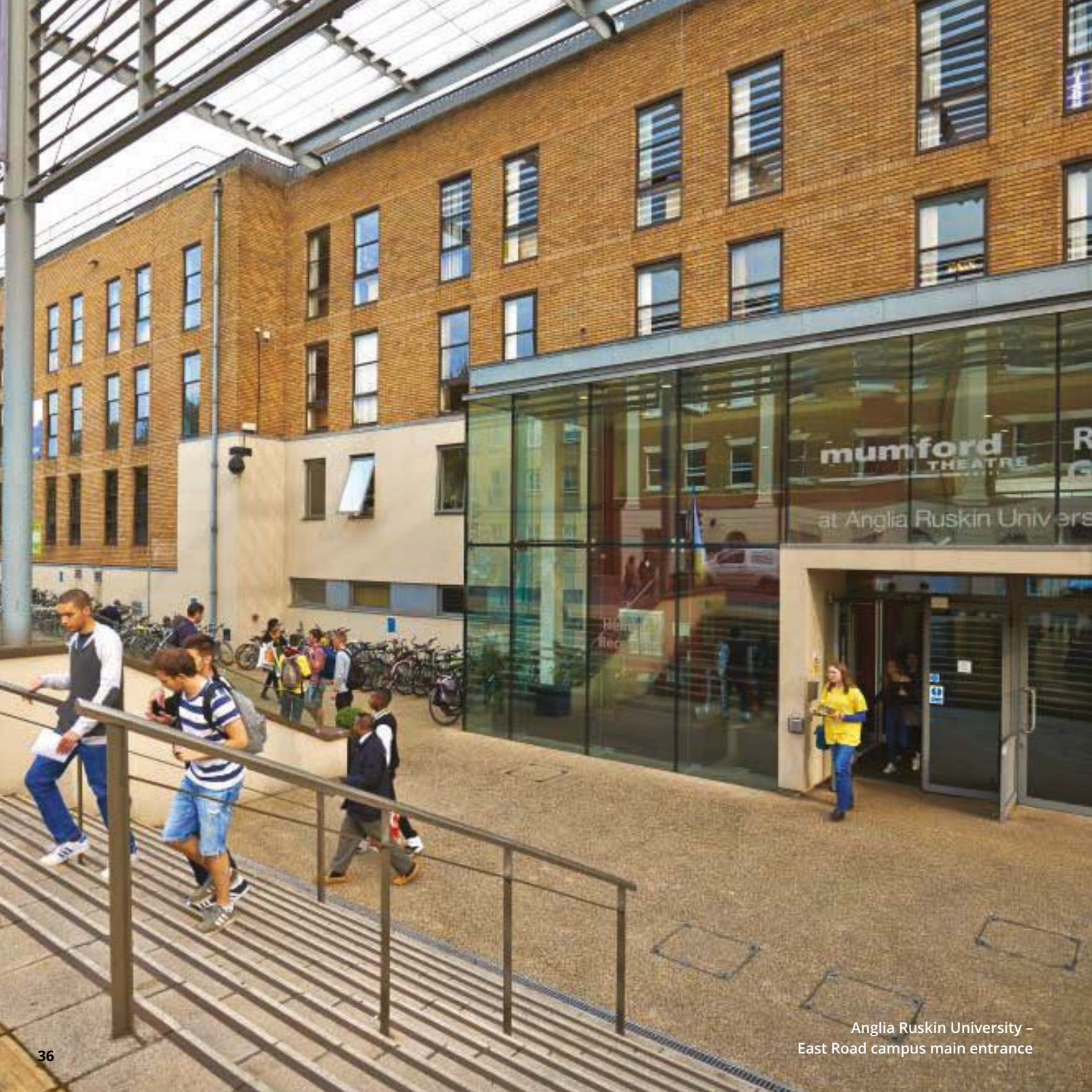
Anglia Ruskin University - East Road campus main entrance