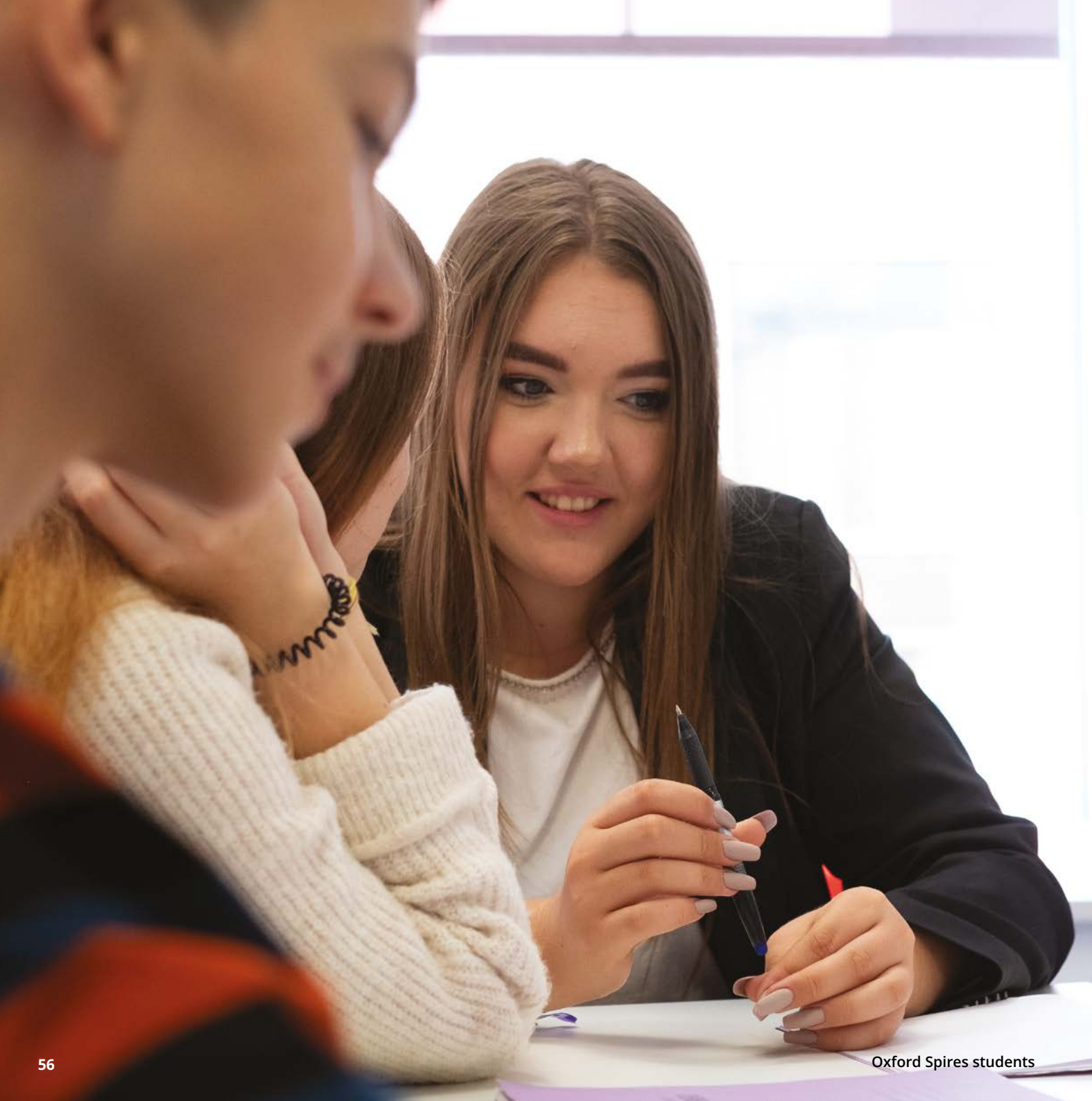
Oxford Spire students