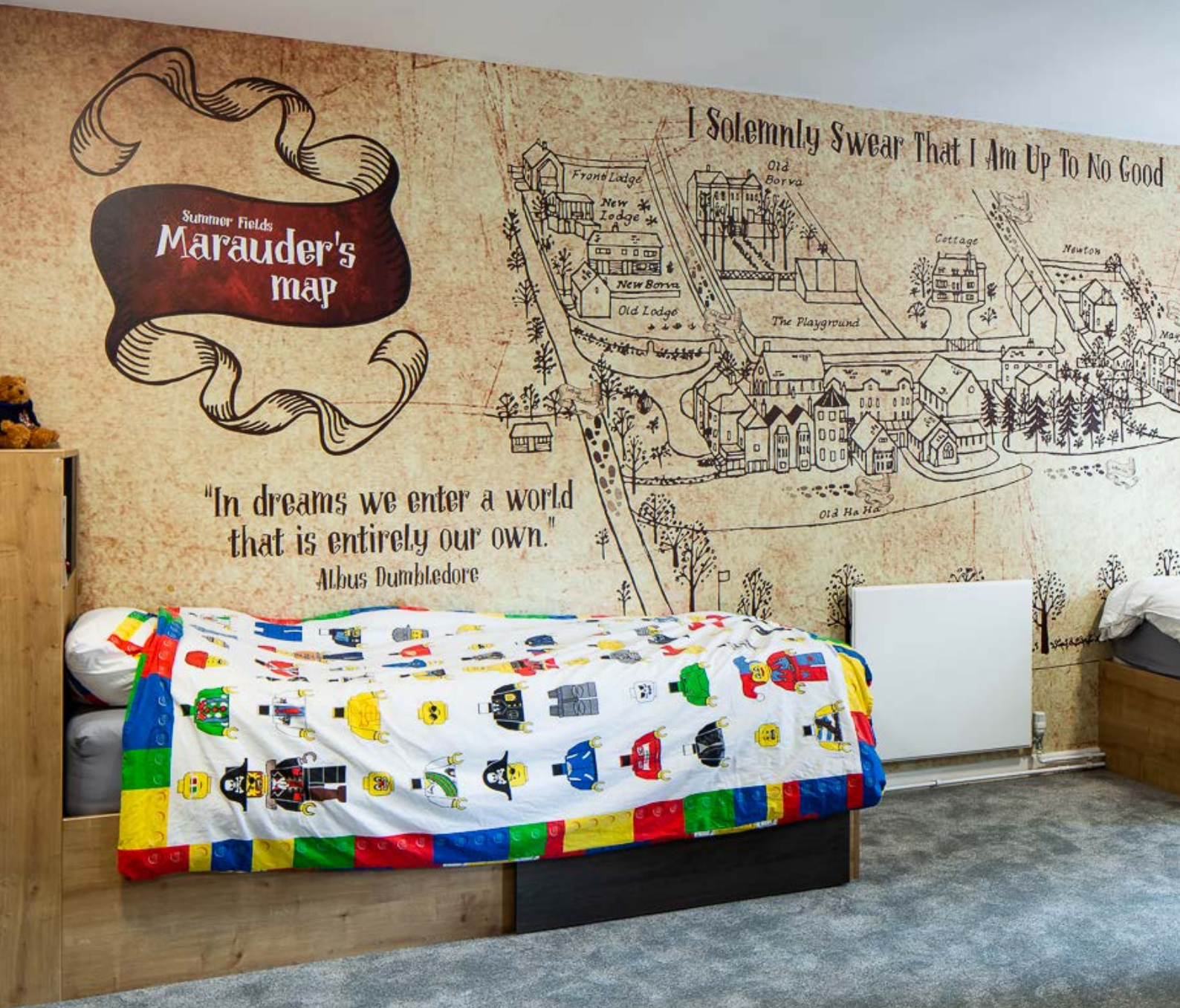
Summer Fields School boarding house bedroom