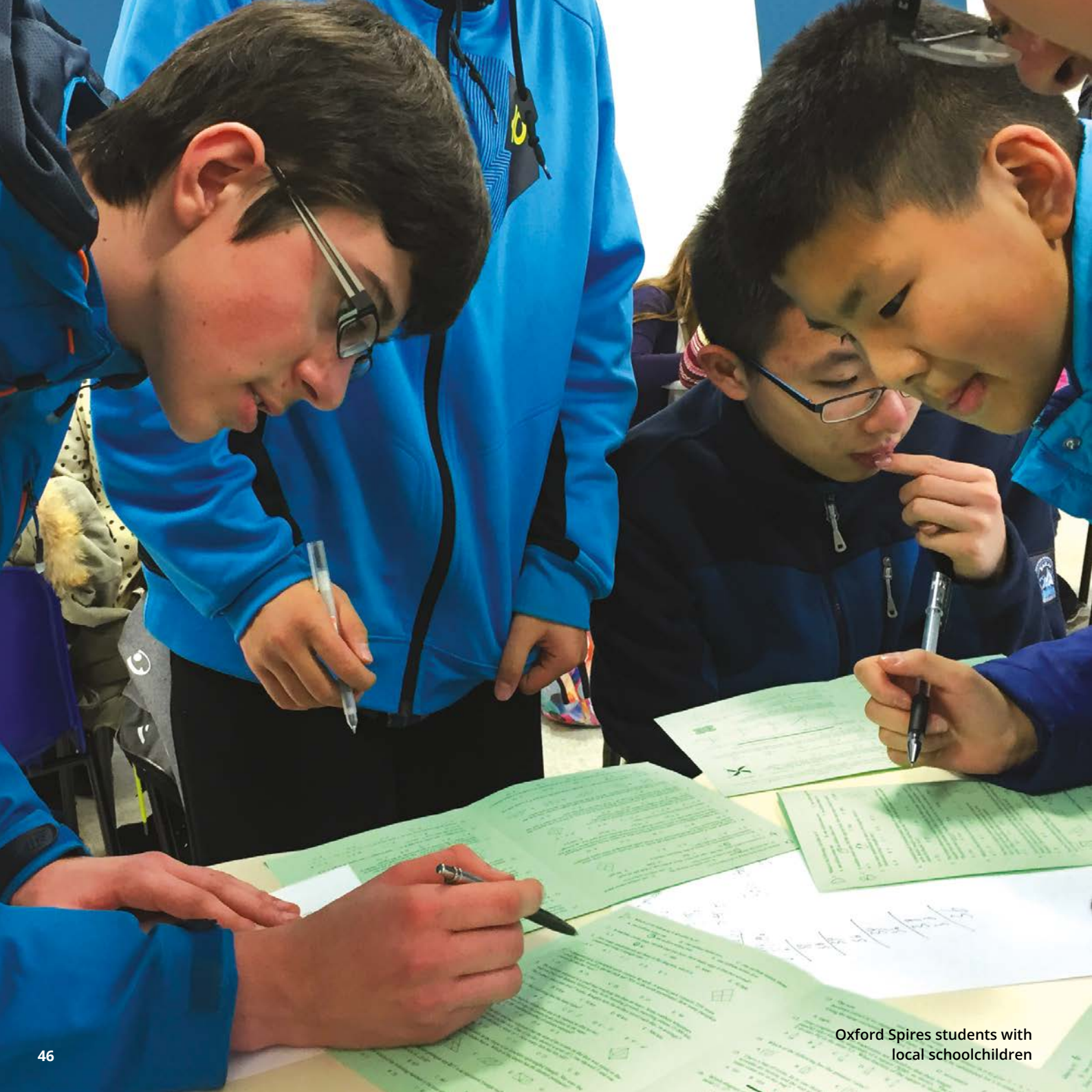
Oxford Spires students with local schoolchildren