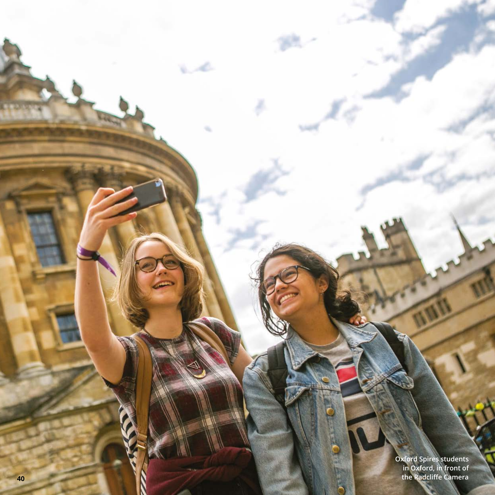
Oxford Spires students in Oxford, in front of the Radcliffe Camera