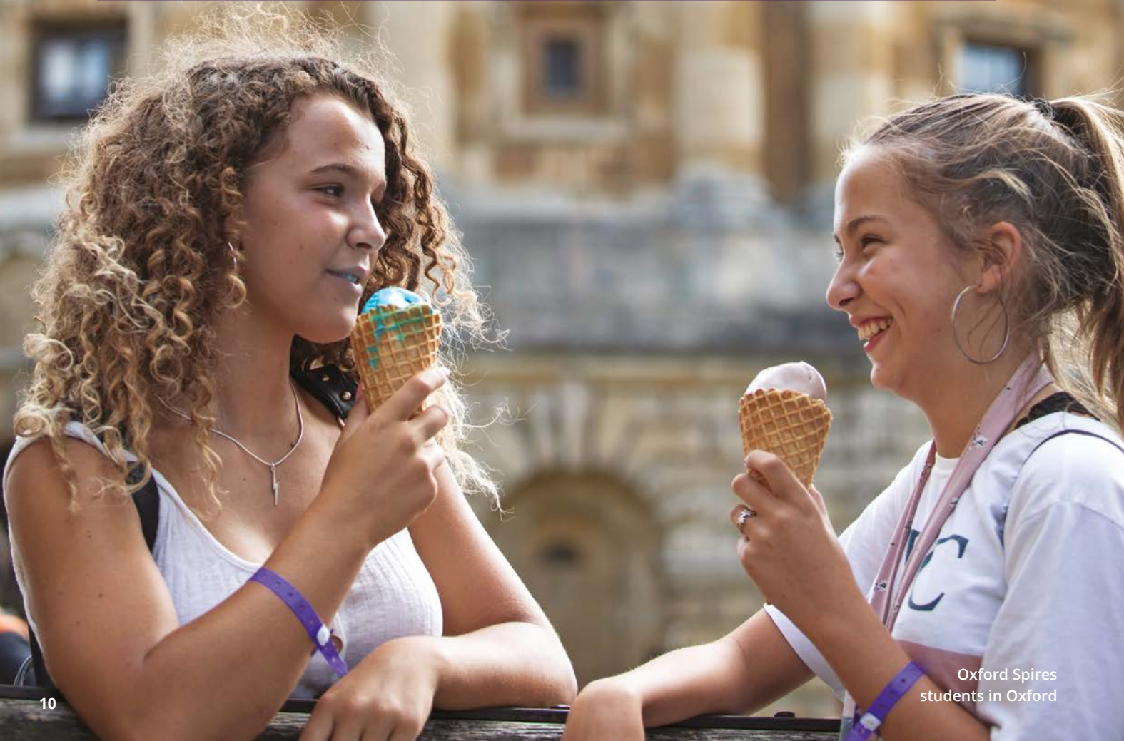
Oxford Spires students in Oxford

Our mission is to provide a safe, enjoyable and enriching learning experience. We aim to be helpful and efficient, honest and reliable, and strive to build students' confidence in using the English language through meaningful experiences.